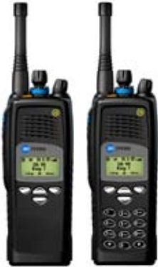
Models shown IS TP9155 and IS TP9160